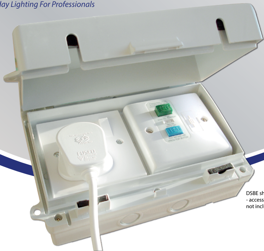
DSBE shown - accessories not included